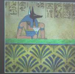
Anubis, god of under the table...