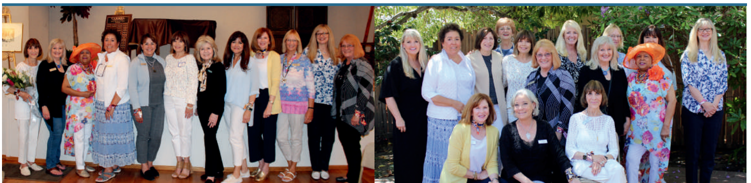
WE LOVE OUR BOARD MEMBERS!