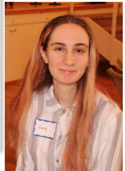
Scholarship recipients at the Annual Luncheon.